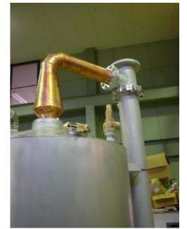
AD-1000 (Simple copper specification type)